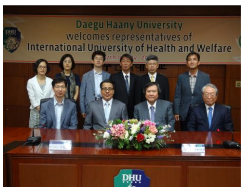
Signing Ceremony of Agreement with Daegu Haany University, Republic of Korea (2013)