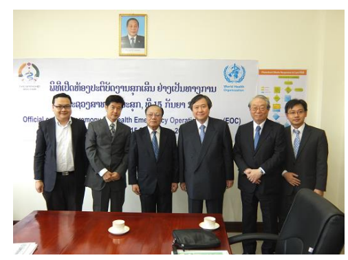
Meeting with the Vice-Minister for Health, Laos (2014)

IUHW established its unique scholarship program in 2001, with the aim of improving the status of professionals in the fields of medical care and welfare, and contributing to the development of future leaders in Asian countries. Since then, IUHW has been accepting IUHW Scholarship Students in cooperation with the Asia–Pacific Ladies Friendship Society. There is a rule which obliges IUHW Scholarship Students to go back to their home countries upon completion of their studies at IUHW and to take a leadership role for the purpose of developing medical and welfare situations in their home countries. It makes the scholarship a more valuable one.