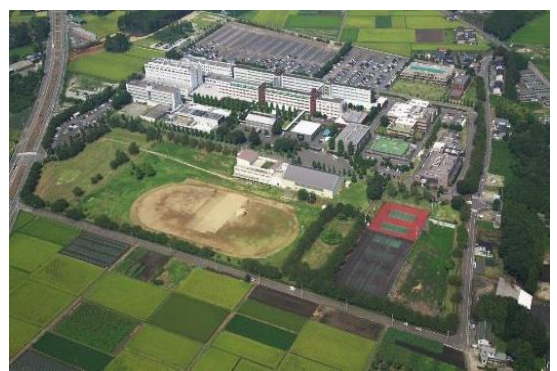
Ohtawara Campus(Tochigi Prefecture)

The International University of Health and Welfare (IUHW) was founded in 1995 as Japan's first university specializing in medical care and welfare, with the aim of training various professionals in the fields of medical care and welfare, and improving their status. The university currently operates 16 departments in six schools at campuses in Ohtawara City (Tochigi Prefecture), Odawara City (Kanagawa Prefecture), Fukuoka City and Ohkawa City (both in Fukuoka Prefecture) where nearly 6,900 students study including IUHW graduate students.