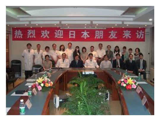
Exchange with China Rehabilitation Research Center (2010)